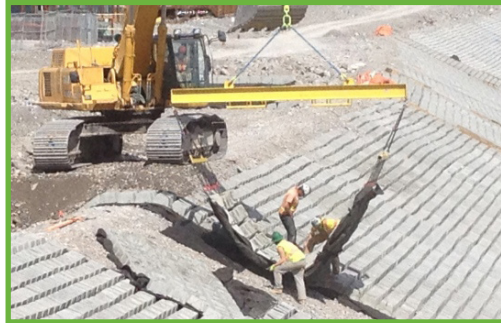
Flood mitigation on Cougar Creek: laying articulated concrete mattresses.

Meanwhile, Canmore has been fast-tracking $14M worth of remediation and mitigation initiatives. The channel of Cougar Creek, a steep watercourse that raged through the north side of the town in June 2013, ripping some creekside homes from their foundations, is being rebuilt by lining it with 45,000 m 2 of reinforced concrete mattresses (see photographs). Crews worked 24/7 shifts to complete the work prior to the start of this year's freshet, fearful lest history repeat itself. That worry has now become reality. As I write on June 18, 2014, rivers in southwestern Alberta