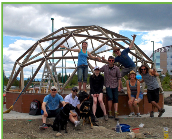
Lending a hand (and a paw) to build UNBC's Dome Greenhouse

The UNBC student club, Students for a Green University (SGU) and the Northern Undergraduate Student Society (NUGSS), is in the process of building a geodesic dome greenhouse on campus. The greenhouse will enable students to grow food locally for an extended period of time throughout the year. By doing so, UNBC students will be helping to