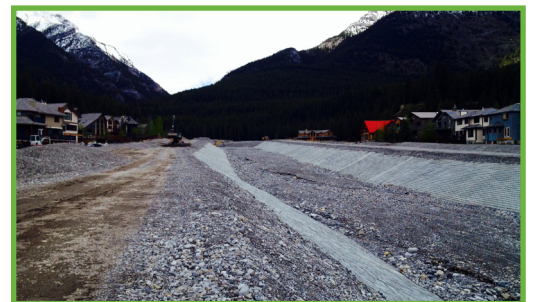
Cougar Creek channel lined with articulated concrete mattresses.

That message—that adaptation to global warming is not optional—forms the central theme of the next PICS online short course that we will release this summer. And the imperative to adapt brings with it another truth: failing to take steps to reduce greenhouse gas emissions and slow global warming will be costly. In fact, it already is.