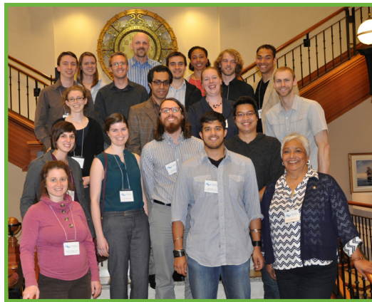
PICS Fellows at the symposium held in Vancouver, April 2014